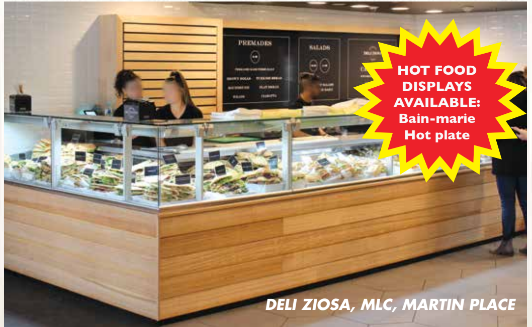
DELI ZIOSA, MLC, MARTIN PLACE